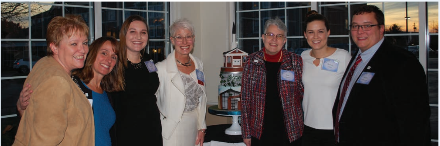
UMRC Foundation Celebrates Success of Growing to Serve Campaign.