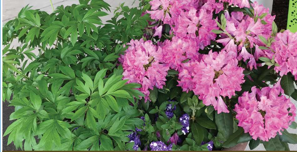
Flowers at the entrance to Dancey House.

Building on a foundation of more than 113 years of service, United Methodist Retirement Communities promotes the wellness, dignity and independence of older adults by providing high-quality and innovative residential and supportive services.