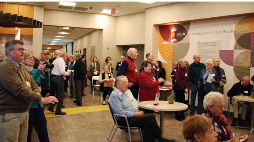
Kresge Center Open House Celebration.