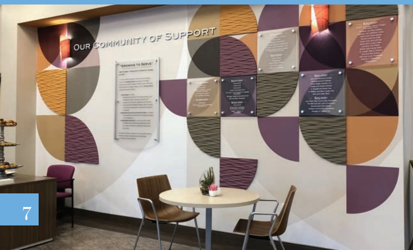
The Donor Wall at Kresge Center.