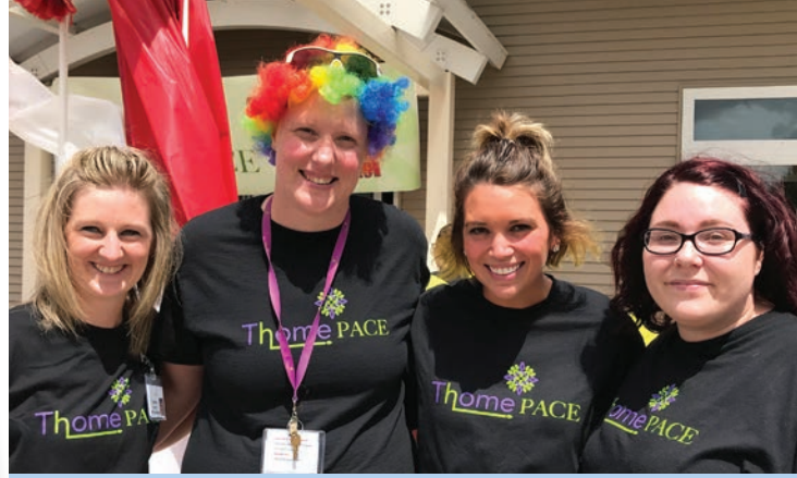
Thome PACE Team Members Clown Around at Summer Picnic.