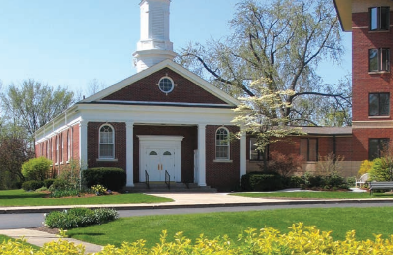
Springtime Blooms Around Chelsea Retirement Community Chapel.