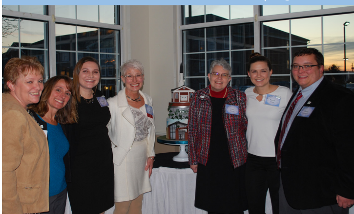
UMRC Foundation team celebrates campaign.

"The tremendous impact this campaign has had—and will continue to have—is far beyond what we had ever imagined and far exceeds any dollar amount. I am so proud of the accomplishments our Foundation staff, board, volunteers, and supporters have helped us achieve. However, our work does not stop here. There are still great opportunities ahead to serve this growing population of older adults. UMRC and the UMRC Foundation will continue to be at the forefront of innovative and compassionate care for older adults and their families." ■