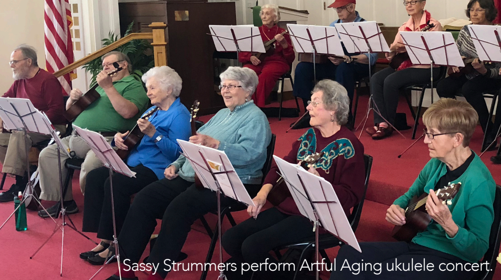
Sassy Strummers perform Artful Aging ukulele concert.