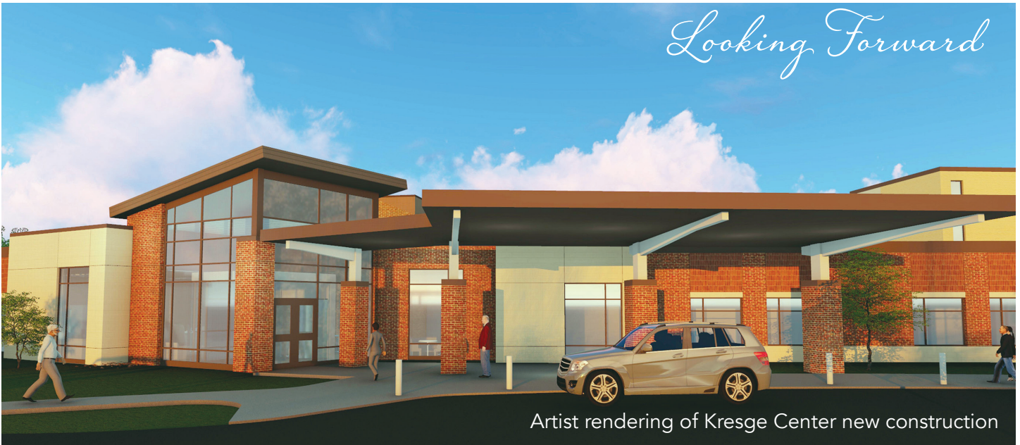
Artist rendering of Kresge Center new construction