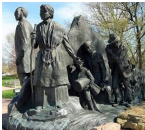
Underground Railroad Monument in Battle Creek

https://www.michigan.gov/mhc/michigan-history/michiganfreedomtrail