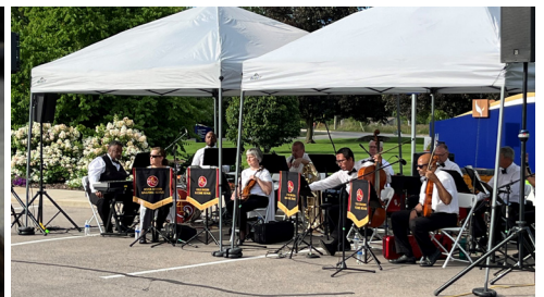
River Raisin Ragtime Revue