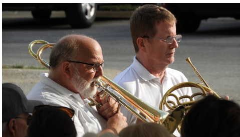
Grand Rapids Symphony