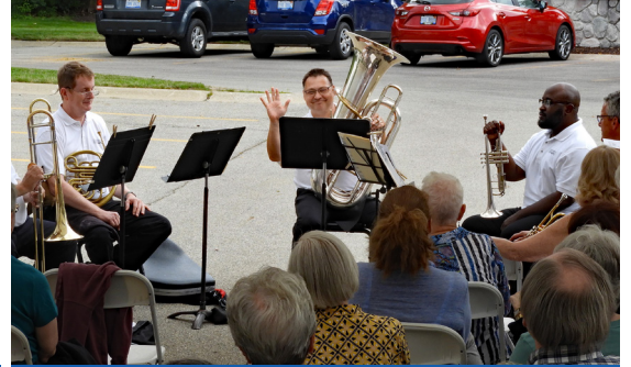
A wave from the tuba player

The UMRC-Porter Hills Foundation is grateful to our donors, including those who have given to the John Thorhauer Legacy Fund , for blessing our residents with the gift of music this summer! Residents at our Cook Valley Estates, Chelsea Retirement