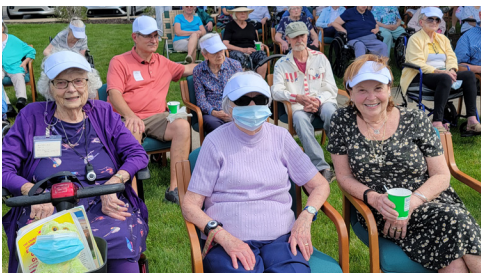
Smiles from Porter Hills Village

Community, The Cedars of Dexter, and Porter Hills Village campuses have all enjoyed some summertime treats, food truck fare, as well as toe-tapping live music! The smiles on their faces tell the story! ■