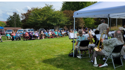
Sam's Swing Band entertains