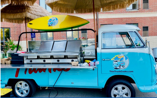
Frank's Food Truck