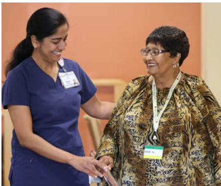
Huron Valley PACE physical therapist helps participant gain strength.

Huron Valley PACE serves older adults of the following ethnicities: 54% White/Caucasian, 34% African American, 4% Hispanic or Latino, 2% Middle Eastern, 1% Asian or Pacific Islander, 1% American Indian, 4% other.