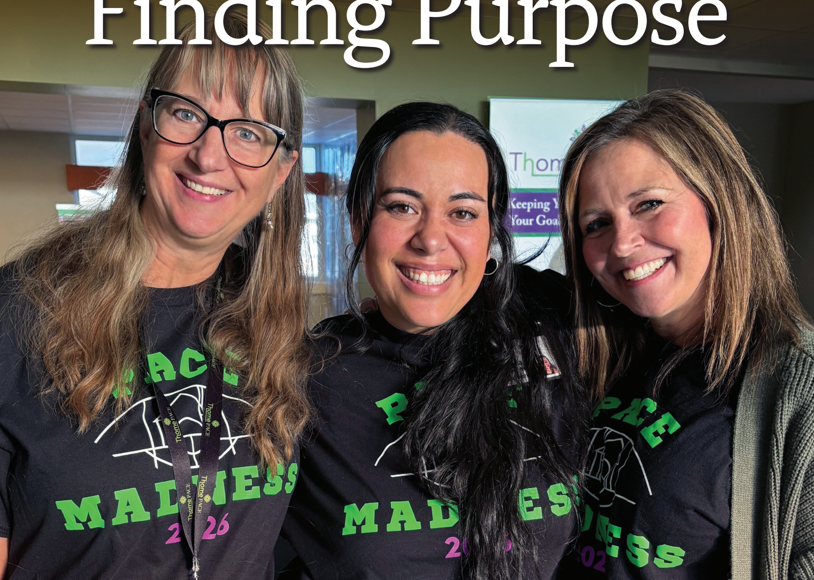
Thome PACE team members bring joy to those they serve.