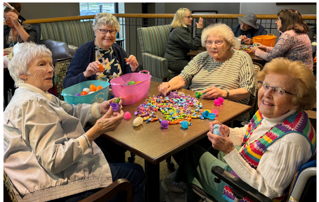
Resident volunteers fill Easter eggs at Chelsea Retirement Community.